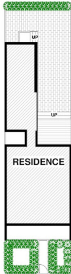
SITE PLAN (NOT TO SAME SCALE)

PLAN FOR PROMOTIONAL PURPOSES. LAYOUT / DIMENSIONS ARE APPROX. NO LIABILITY WILL BE ACCEPTED.